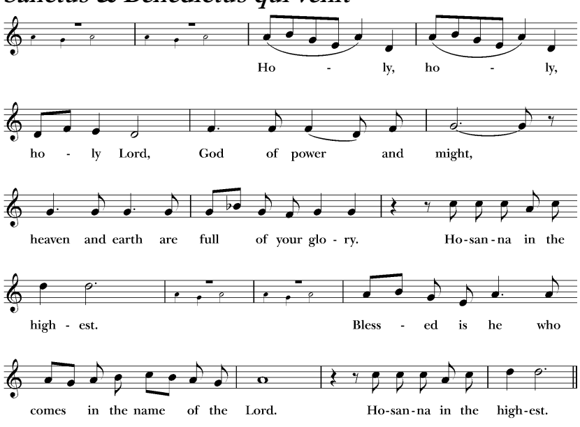
The people kneel as able.